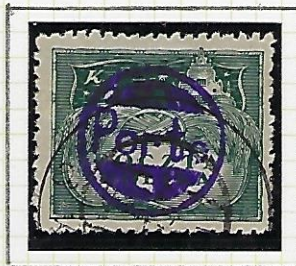
1 k: green

Unlike the corresponding issue by Cieszyn-2 Post Office, in this case the inclusion of the 1 korona stamp in the "Porto" overprints has definitely been officially authorised.