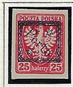
25h: vermilion (blue-tinted paper)