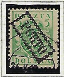
5h: bright green