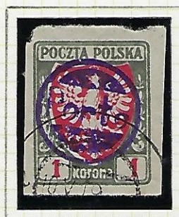
1k: grey & red (blue-tinted paper)

Only the 6h orange stamp of this issue was not overprinted for service as a postage due stamp.