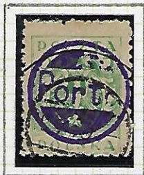
5h: bright green