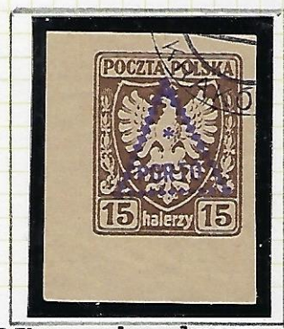
15h: ochre-brown (yellowish paper)