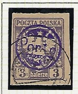
3h: pale violet (yellowish paper)