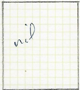
70h: light blue (blue-tinted paper)