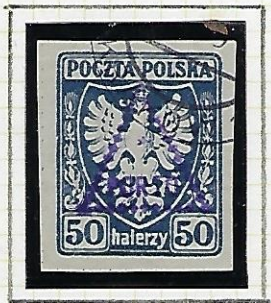
50h: dark blue (blue-tinted paper)