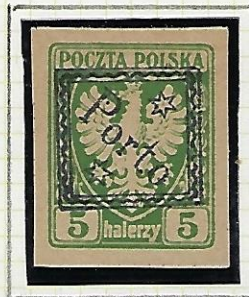
5h: bluish green (yellowish paper)