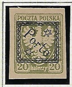
20h: olive-green (yellowish paper)