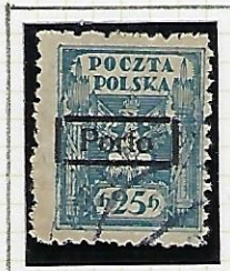
25h: pale blue