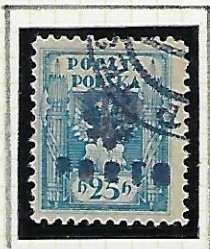
25h: pale blue