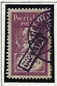
10f mauve: Polish White Eagle

Unlisted , which is particularly suspicious because Grudziądz is in northern Poland, where there appears to have been no shortage of Postage Due stamps as in the ex-Austrian southern parts.