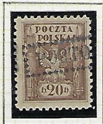
20h: Pale grey-brown Overpt. horizontal