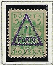
5h: bright green