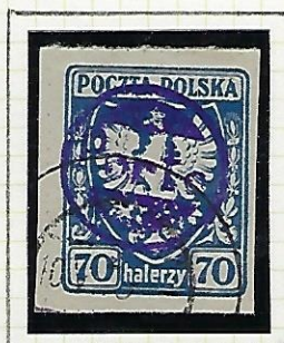
70h: light blue (blue-tinted paper)