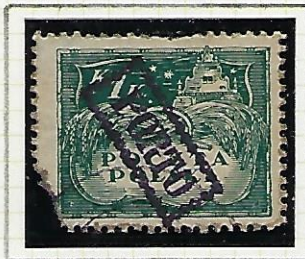
1 k: green (damaged stamp)