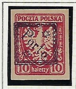
10h: carmine (Yellowish paper)