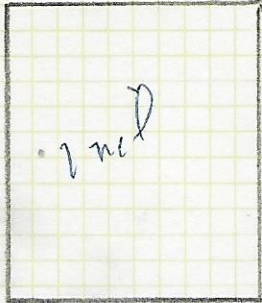
3h: pale violet (yellowish paper)