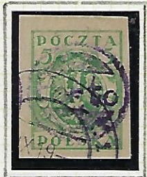
5h: bright green