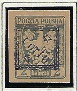
2h: pearl grey (yellowish paper)

Issued by Kraków I Post Office. Machine-overprinted in black. Imperforate. Un-gummed. Official.