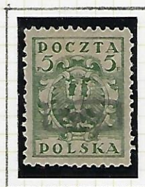
5f: bright green

Note: These forgeries have been produced using Northern Polish stamps in f(enigów) valuta. They have therefore