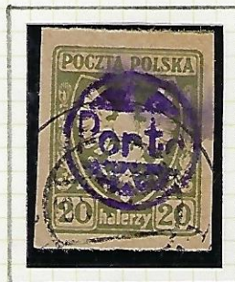
20h: olive-green (yellowish paper)