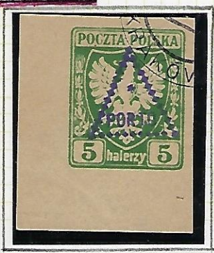
5h: bluish olive-green (yellowish paper)