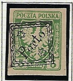
5h: bluish green (Yellowish paper) (Colour variations: light green)

(Do they? I suspect these are forgeries - see previous page)