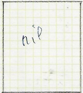
2h: pearl grey (yellowish paper)

Issued by Kraków-11 Post Office; overprinted with rubber hand-stamp, in violet-black. Imperforate, un-gummed. Official.