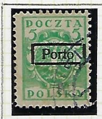
5h: bright green