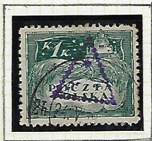
1 k: green