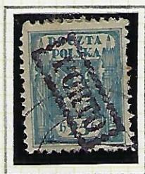
25h: pale blue