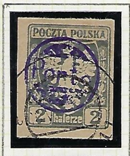
2h: pearl grey (yellowish paper)