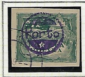
1 k: green

Note: These overprints seem not to be listed as "Official", but there appears to be no countermand to their issue. They may therefore well be regarded as "official(ly authorised)".