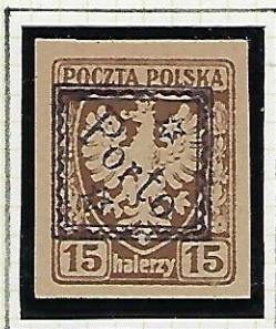
15h: brown (yellowish paper)