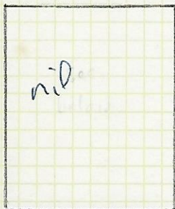
50h: dark blue (blue-tinted paper)