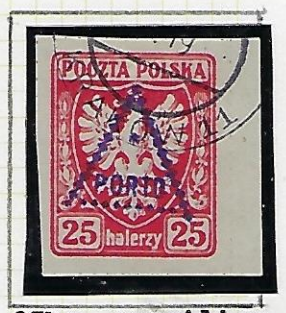
25h: vermilion (blue-tinted paper)