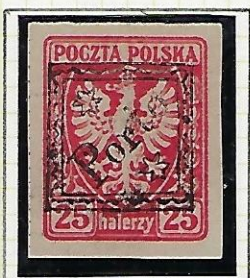
25h: vermilion (blue-tinted paper) (Colour variations: Light vermilion)