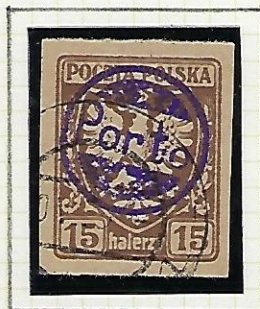
15h: brown (yellowish paper)