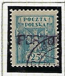
25h: pale blue