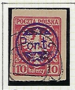
10h: carmine (yellowish paper)