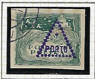
1 k: green.