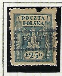
25h: pale blue Overpt. horizontal (damaged)