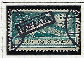
50f greenish blue: Eagle and Ship.