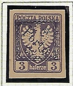
3h: pale violet (yellowish paper)