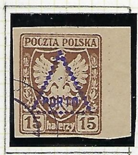
15h: brown (yellowish paper)