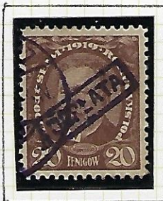
20f brown (21x25mm): W. Trampczynski, President of the Sejm.