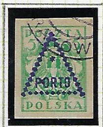
5h: bright green