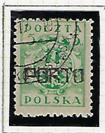
5h: bright green

appear to belong to an un-authorised issue, using the hand-stamps of the earlier official issue. Perforated. Non-official.