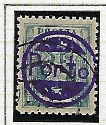
25h: pale blue