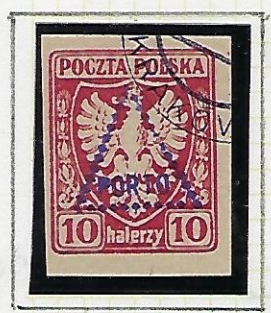
10h: carmine (yellowish paper)