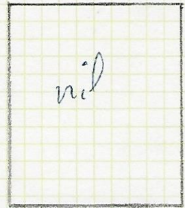
1 k: grey & red (blue-tinted paper)