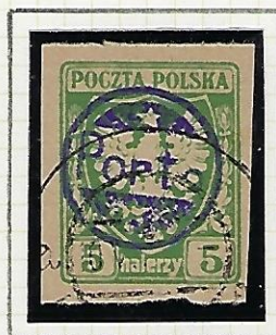
5h: bluish green (yellowish paper)