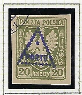
20h: olive-green (yellowish paper)