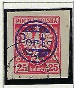
25h: vermilion (blue-tinted paper)