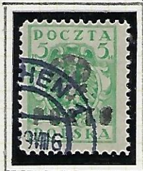
5h: bright green