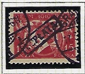
15f red: Prime Minister Paderewski