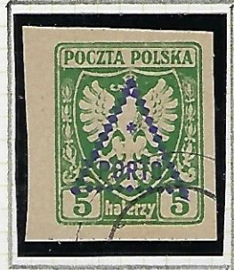
5h: bluish green (yellowish paper)