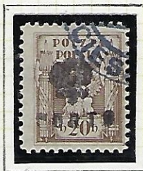
20h: pale grey-brown