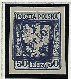
50h: dark blue (blue-tinted paper)