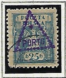
25h: pale blue