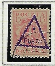
15h: scarlet colour variety