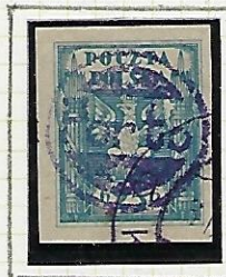
25h: pale blue