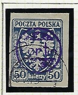
50h: dark blue (Blue-tinted paper)