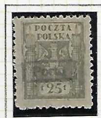
25f: pale blue