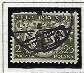
25f sage-green: Gen. Piłsudski