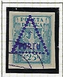
25h: pale blue